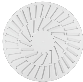
Circular diffuser face with white air control blades