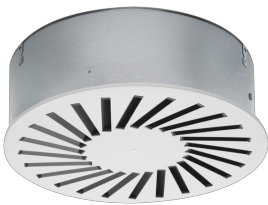
Circular face style with circular plenum box and top entry spigot