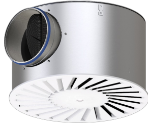
Circular diffuser faces with circular plenum box