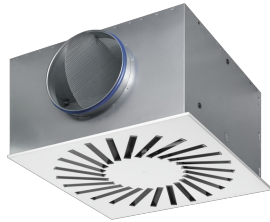
Square diffuser face with square plenum box