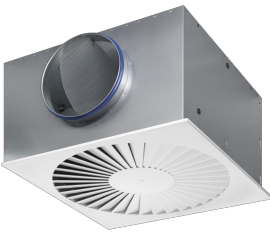
SQUARE DIFFUSER FACE WITH SQUARE PLENUM BOX

Circular diffuser faces with circular plenum box