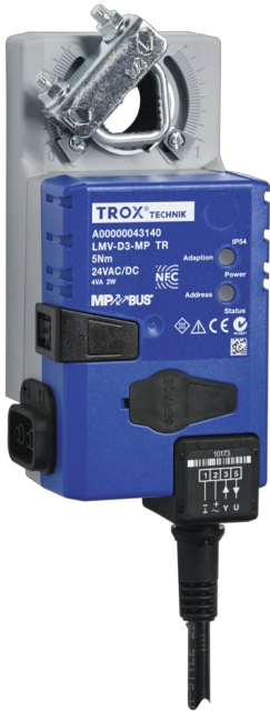
COMPACT CONTROLLER LMV-D3-MP-F